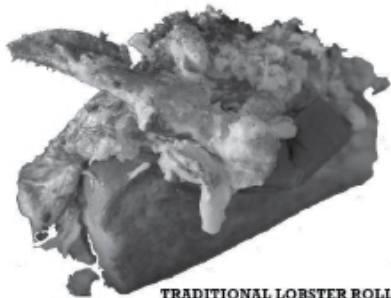
TRADITIONAL LOBSTER ROLL NEW ENGLAND SCOTED BROCKLE & CLAW MEAT, TORNED WARM BUTTER, MAYO & GARLIC, BRIE-TOP BUTTER ROLL, CHEESE

PROUDLY SUPPORTING THE INDIANAPOLIS CHILDREN'S CHOIR